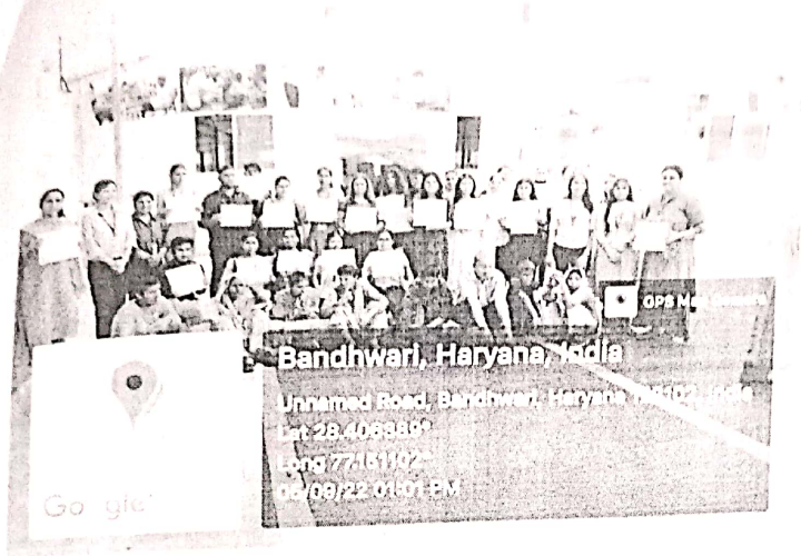
Photo 2: Students and Faculty Visited the Earth Foundation Saviour and received the certificates.